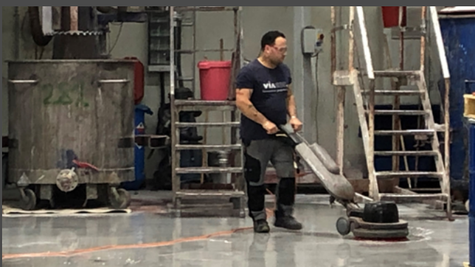
Cleaning with a cleaning machine on WHG floor

By installing properly sized entrance mat systems and cleaning zones the input of dirt and small stones in the building will be reduced and damages on the floor will be avoided. Other protective measures using protective covers on chair and table legs and the use of correct castors (recommended type W according to EN 12529) can help to prevent damages and scratches at the floor surface. During the construction phase before the building is handed over to the user/owner, the new flooring should be protected with suitable coverings and protective films from wear and damages.