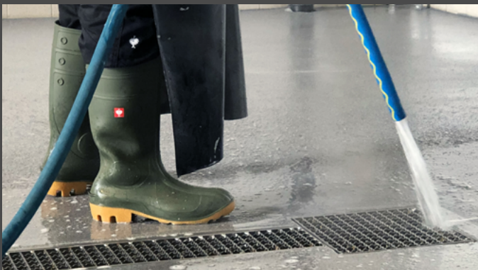
Cleaning of industrial floors in the food industry