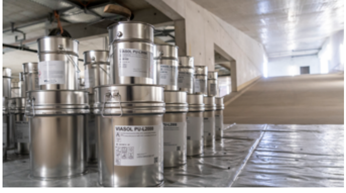
OS 10 seal: VIASOL PU-L2000