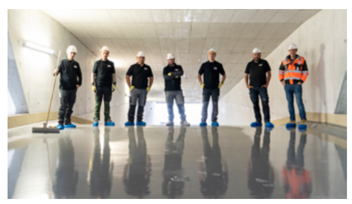
Züblin's team is ready