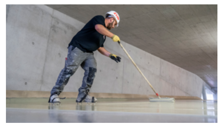
Perfection required: wear layer