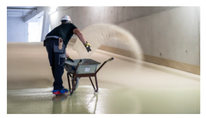
VIASOL DECK rapid M (V2) with quartz sand