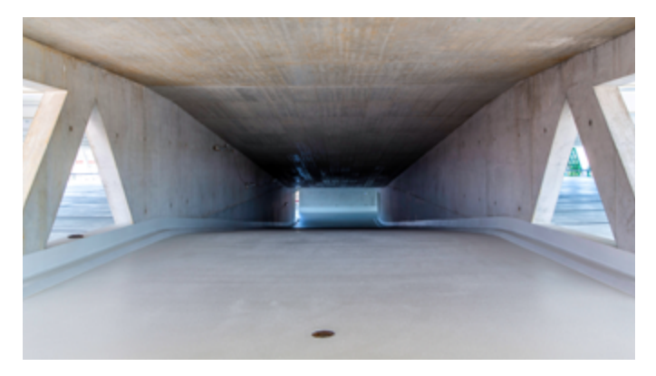
The floor on the ramps was coated with an OS 10