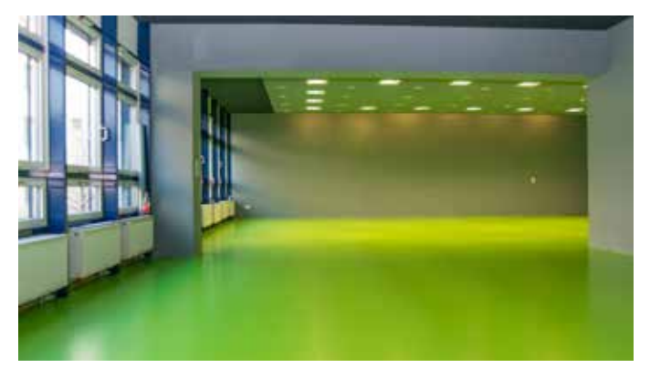
Modern atmosphere after refurbishment