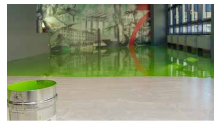
The future chillout-lounge of Esselte Leitz