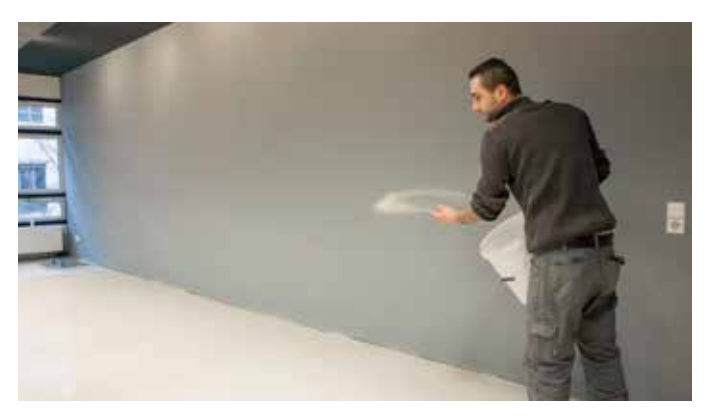
Sanding after applying primer

further processing, the company chose the binder VIASOL EP-P203 in connection with a biaxial texture for the lamination and scratch coat. In order to close the pores and to produce a homogenous surface VIASOL PU-C525 was used as the third layer. The top coat VIASOL PU-C500, an aliphatic, colour solid polyurethane coating corresponded to the desired colour of Esselte Leitz. Applying chips to this PU-coating lead to a special effect and thereby a visual highlight was created. Finally, this high-gloss surface received a colourless, matt seal through the product VIASOL PU-S688N.This extraordinary room is provided with an impressive atmosphere thanks to this design floor and the pretty light incidence.