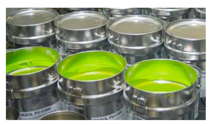
Corporate design colour of Esselte Leitz